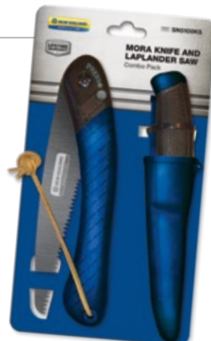
Part No. SN5100KS