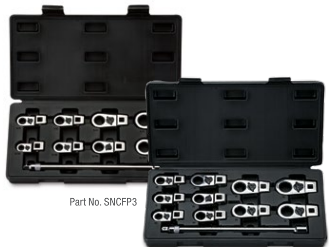
Part No. SNCFP3