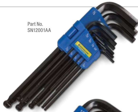
Part No. SN12001AA