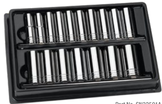
Part No. SN32501A