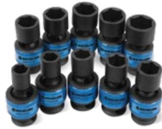
Part No. SN26501