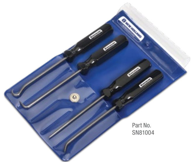
Part No. SN81004