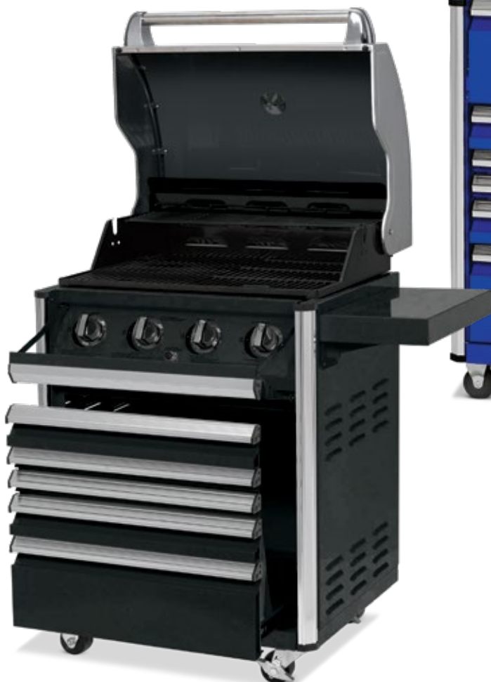
Part No. SNGRILL1NC