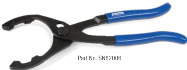
Part No. SN82006