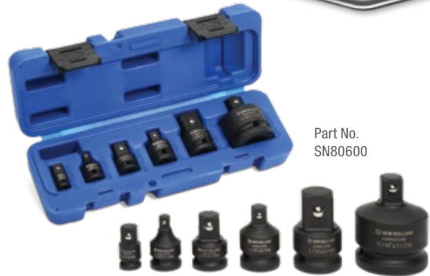
Part No. SN80600