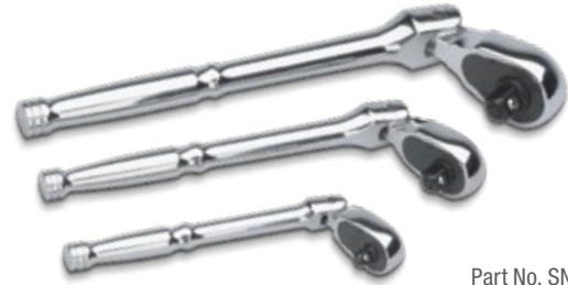
Part No. SN90321