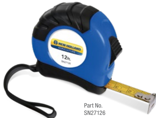
Part No. SN27126