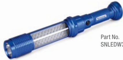
Part No. SNLEDW3