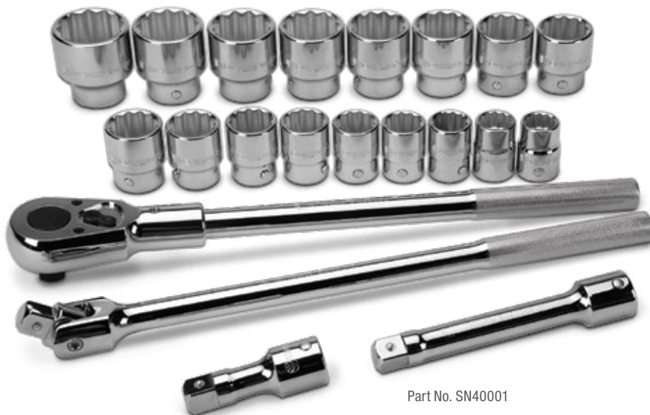
Part No. SN40001