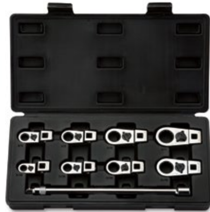
Part No. SN24001