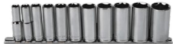
Part No. SN22001