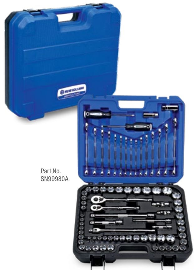
Part No. SN99980A