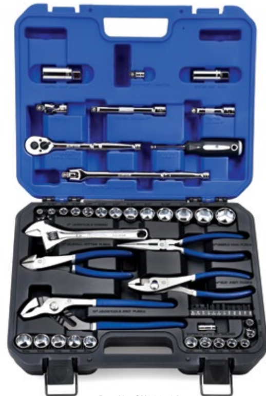
Part No. SN99953A