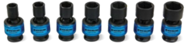
Part No. SN26001