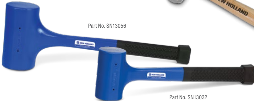
Part No. SN13056