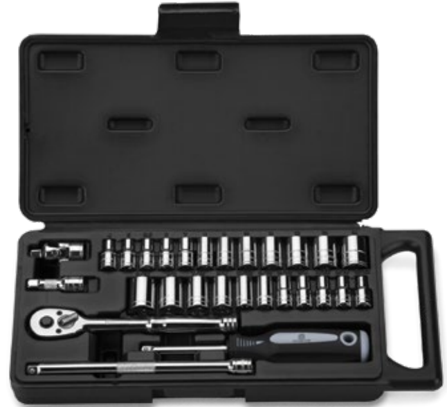
Part No. SN10001