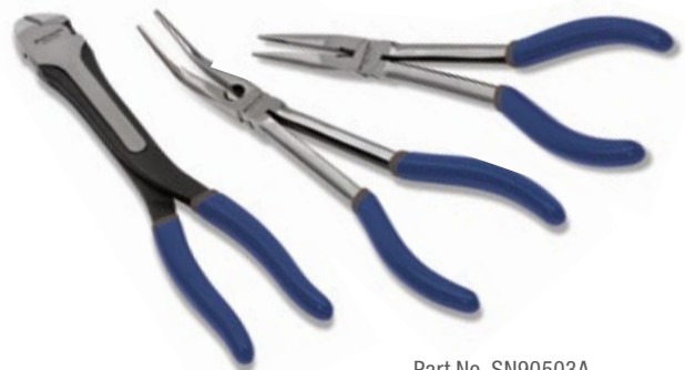
Part No. SN90503A