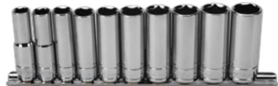
Part No. SN22501