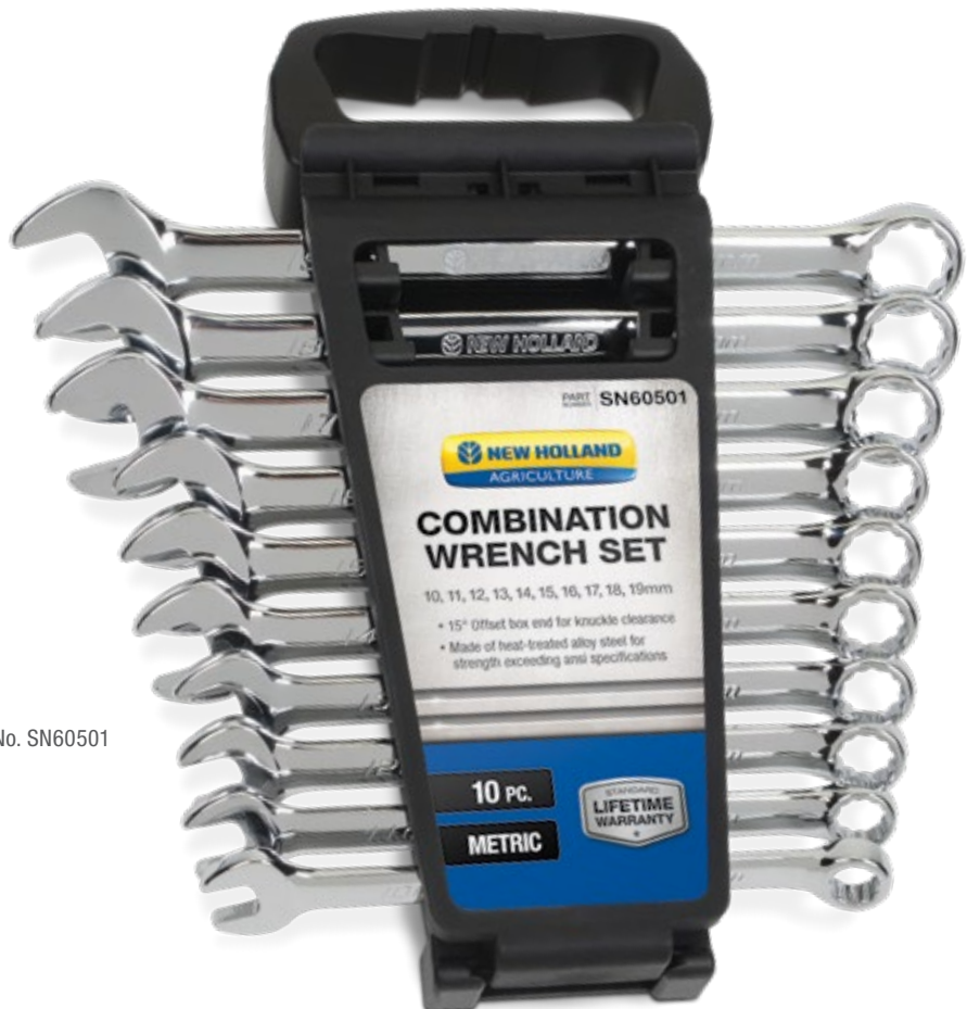
Part No. SN60501