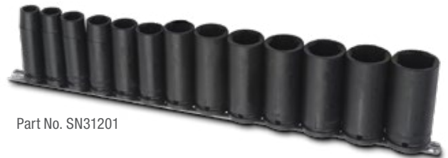
Part No. SN31201