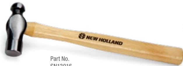
Part No. SN13016