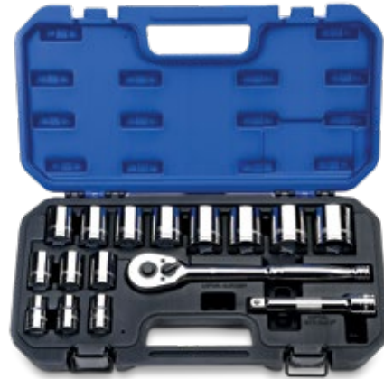
Part No. SN30001AA