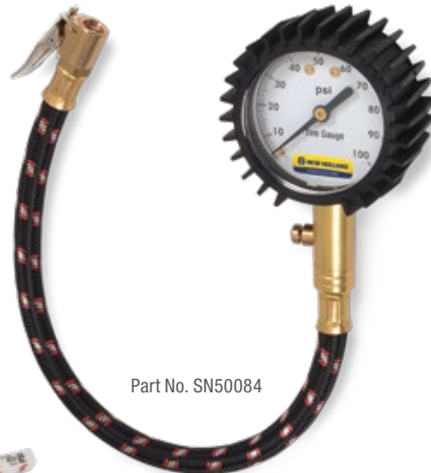
Part No. SN50084