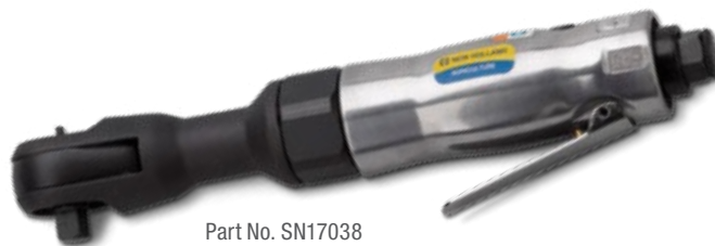
Part No. SN17038