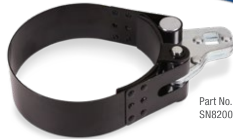
Part No. SN82005