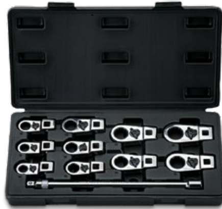
Part No. SN24501