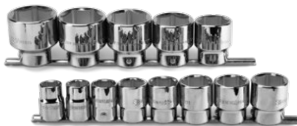
Part No. SN40501