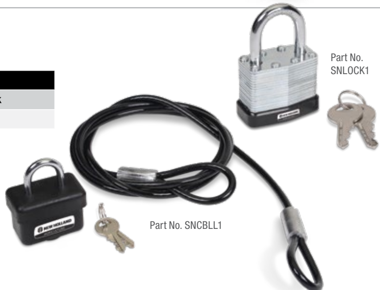
Part No. SNLOCK1