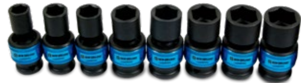
Part No. SN36001