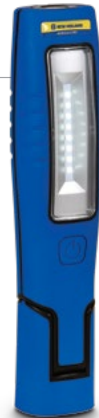
Part No. SNLEDW4