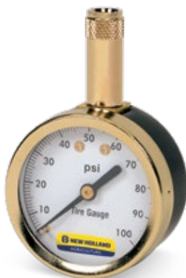
Part No. SN50082