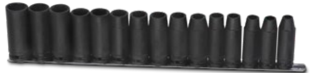
Part No. SN31251