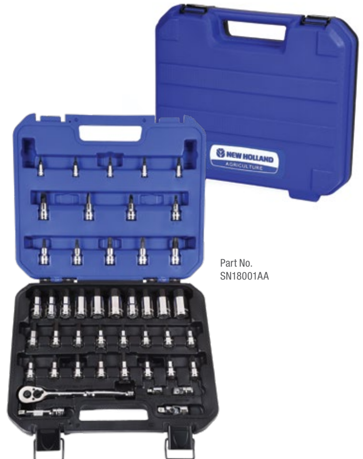
Part No. SN18001AA