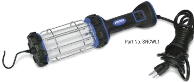
Part No. SNCWL1