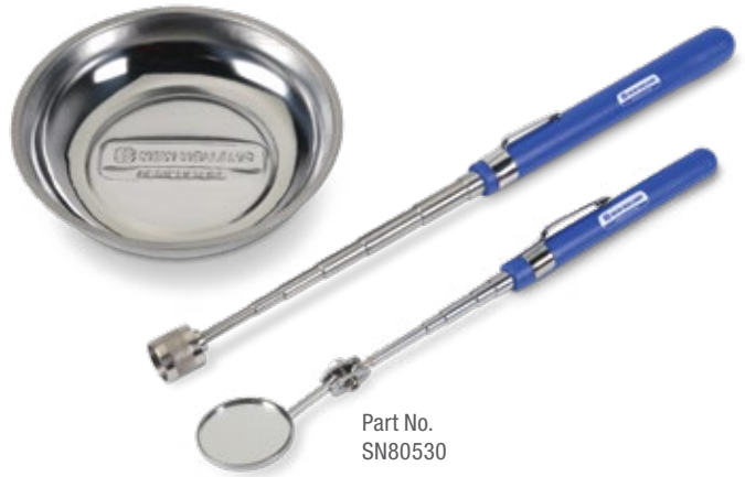
Part No. SN80530