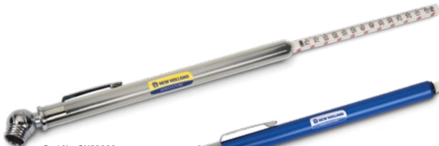
Part No. SN50083