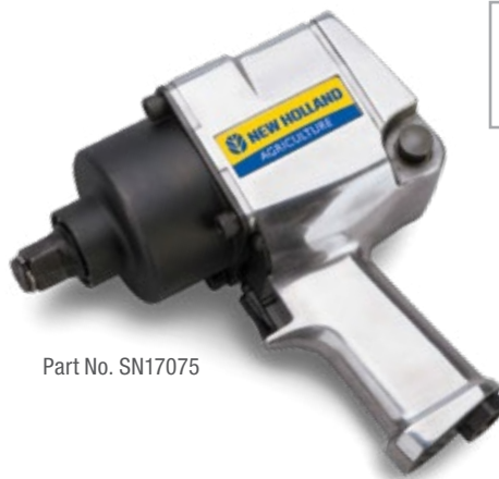
Part No. SN17075