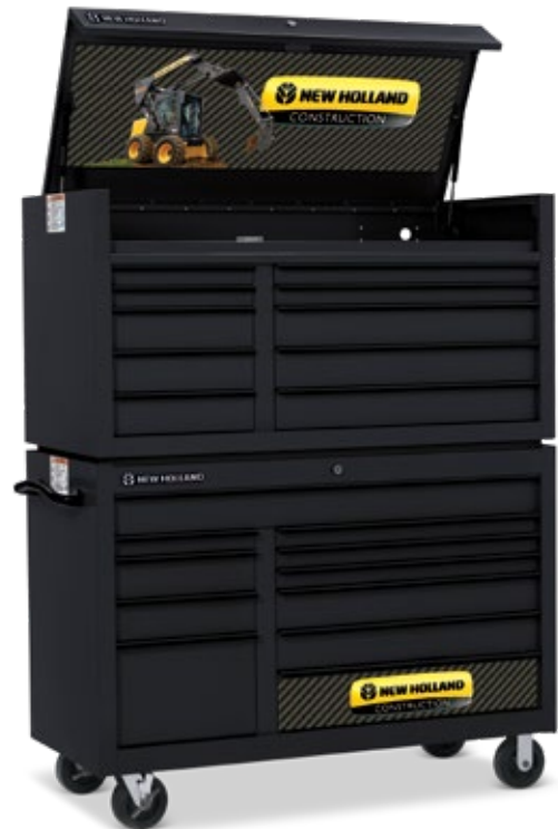
Part No. SN5000NC

Premium line features raised chrome badge logo on top chests and roll cabinets: