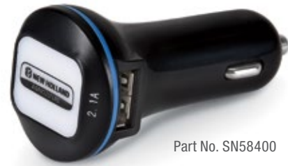
Part No. SN58400