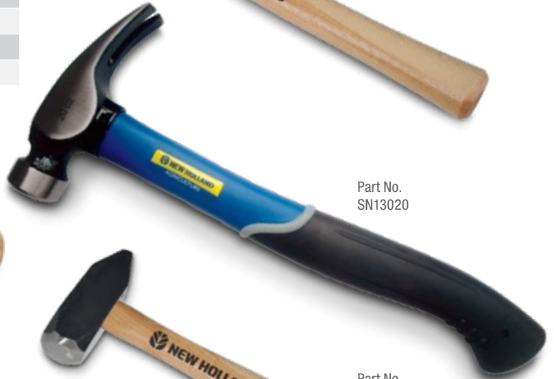
Part No. SN13020