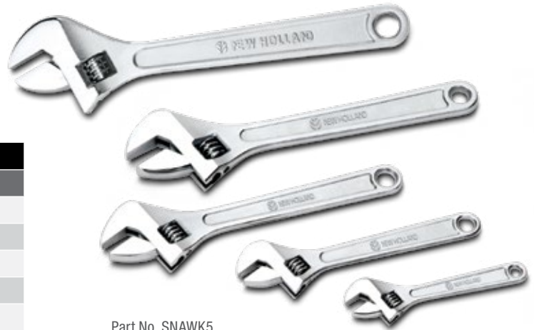
Part No. SNAWK5