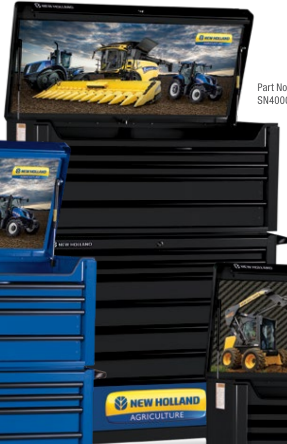
Part No. SN4000AB