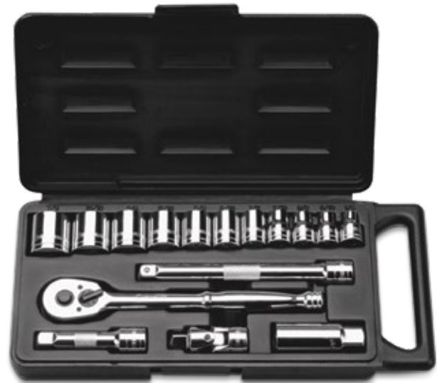
Part No. SN20001A