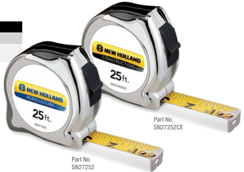
Part No. SN27252