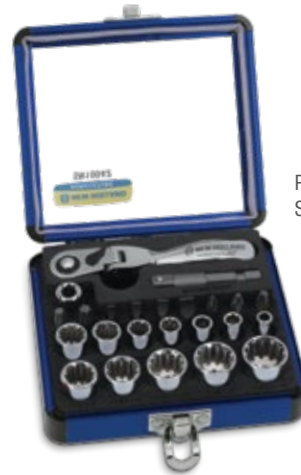
Part No. SN10042