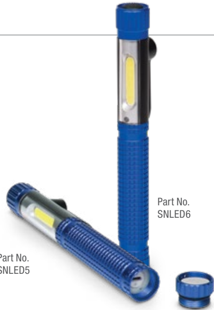
Part No. SNLED6