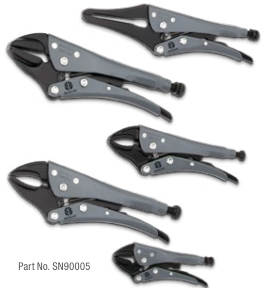
Part No. SN90005