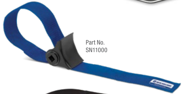
Part No. SN11000