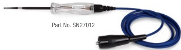
Part No. SN27012