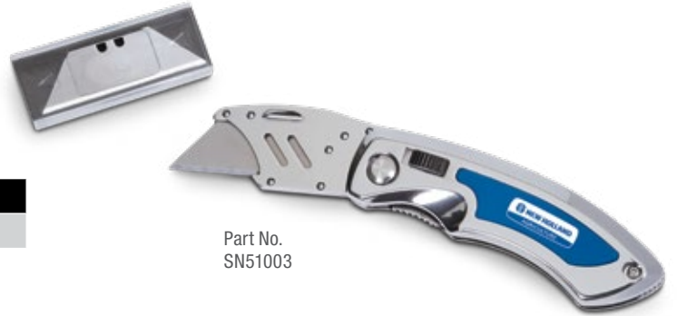
Part No. SN51003