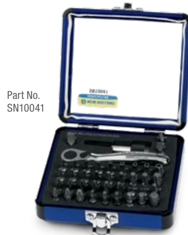
Part No. SN10041