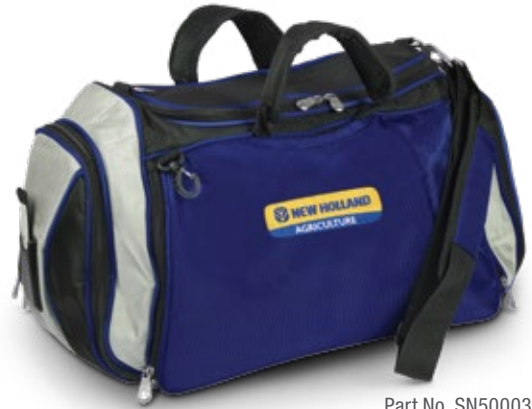
Part No. SN50003