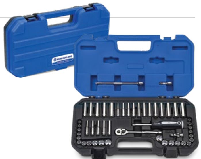
Part No. SN10002A