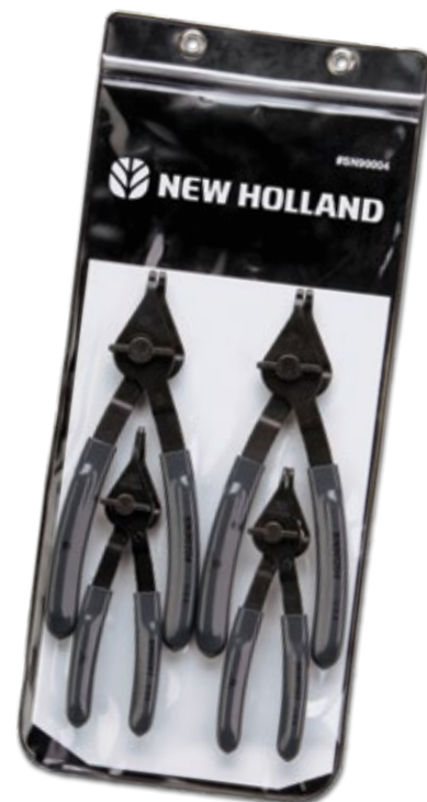
Part No. SN90004