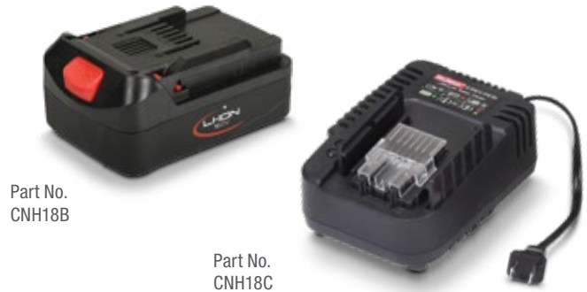
Part No. CNH18B