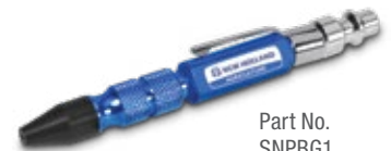
Part No. SNPBG1