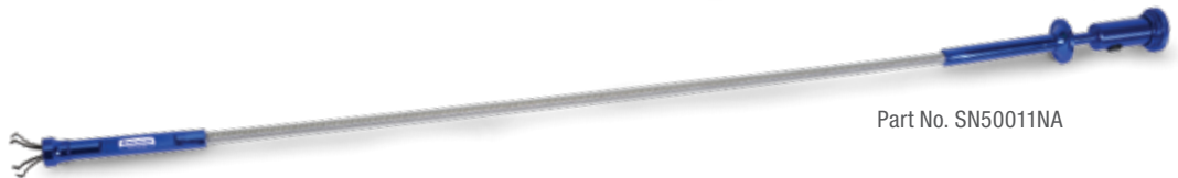
Part No. SN50011NA