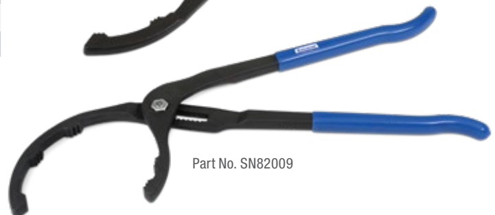
Part No. SN82009