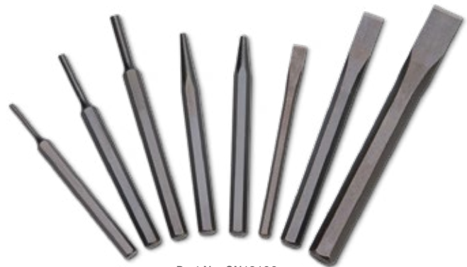
Part No. SN13100