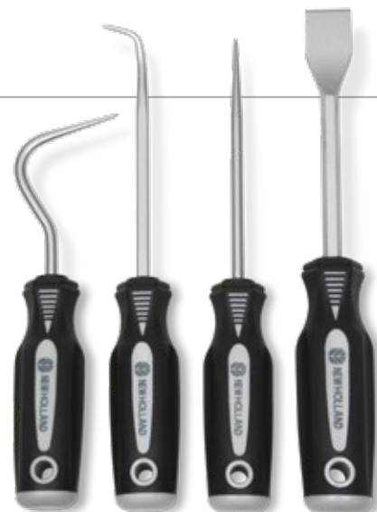
Part No. SN80520