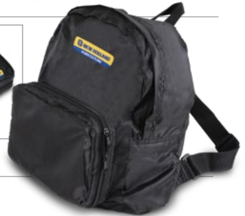
Part No. SN50004BP