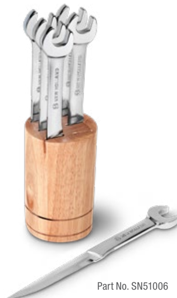
Part No. SN51006