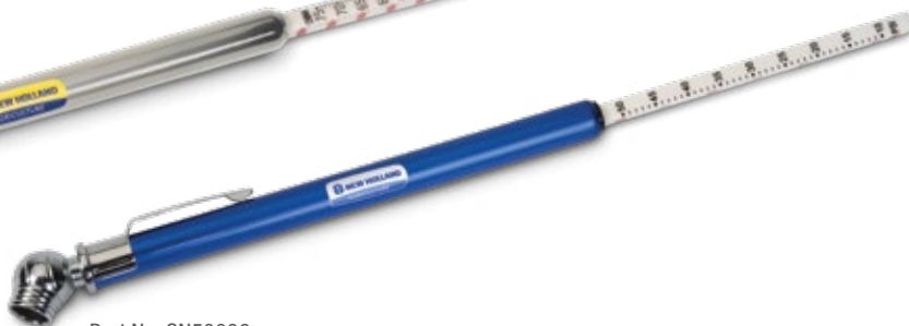
Part No. SN50086