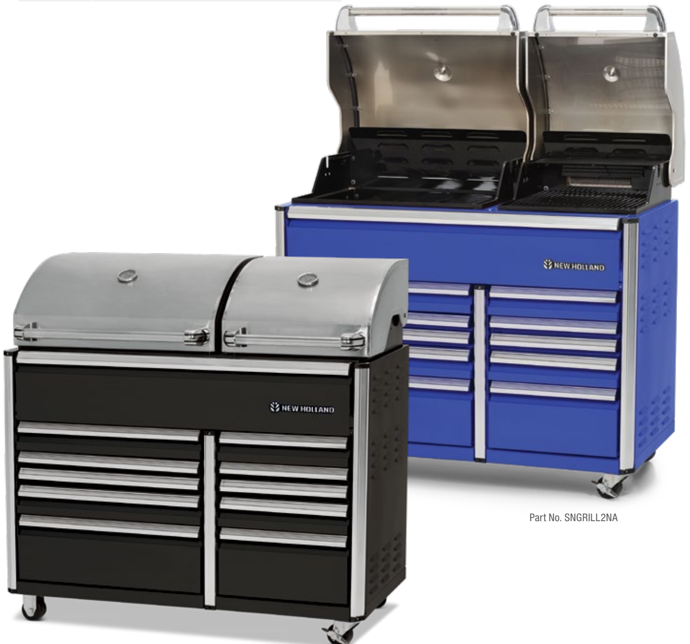
Part No. SNGRILL2NA