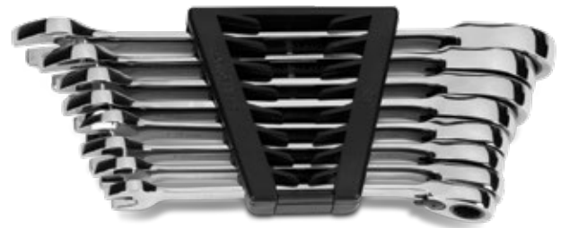
Part No. SN70501