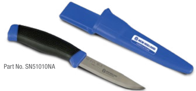
Part No. SN51010A