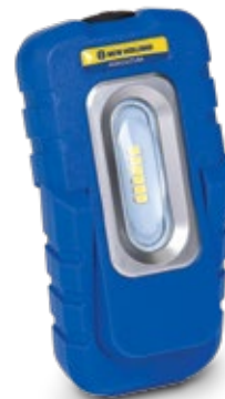
Part No. SNLEDPL1