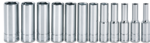
Part No. SN14501