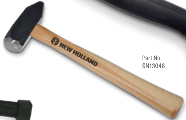
Part No. SN13048