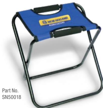
Part No. SN50018