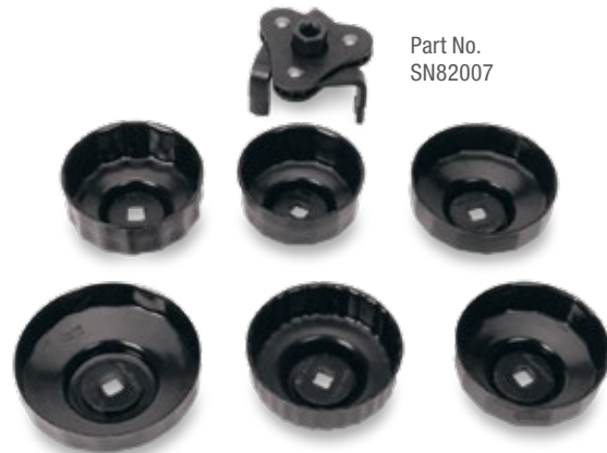
Part No. SN82007