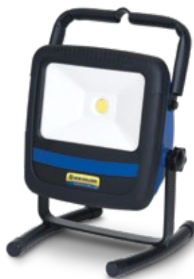
Part No. SNFLOOD