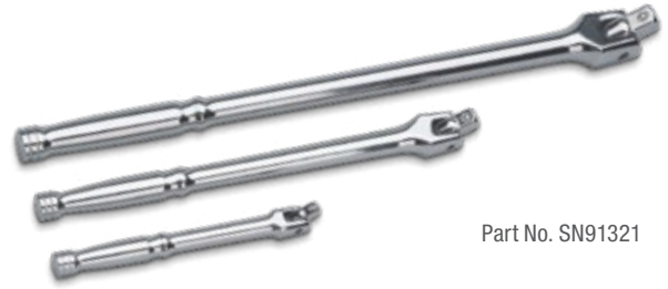
Part No. SN91321