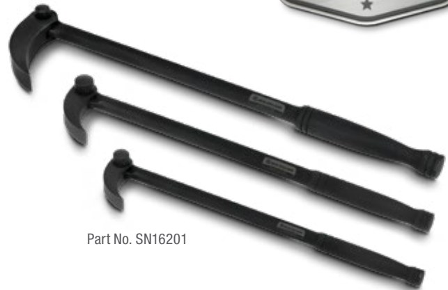
Part No. SN16201