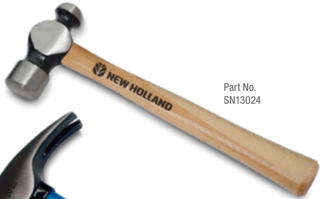
Part No. SN13024