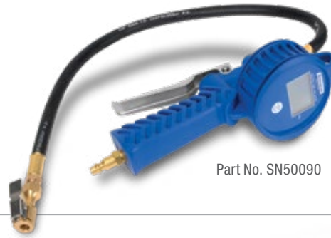
Part No. SN50090