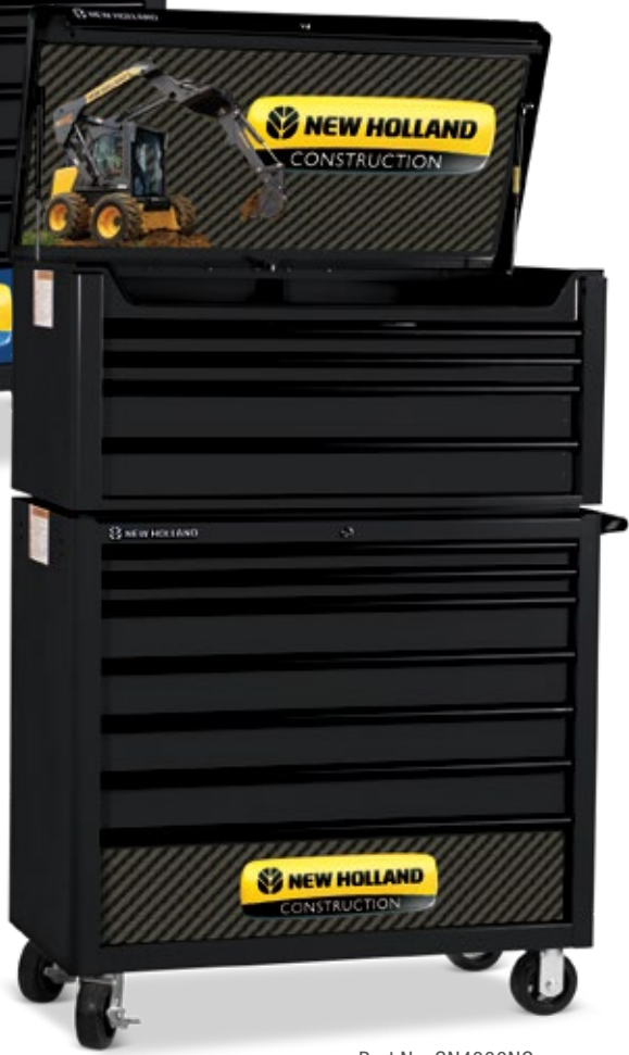
Part No. SN4000NC

Premium line features raised chrome badge logo on top chests and roll cabinets: