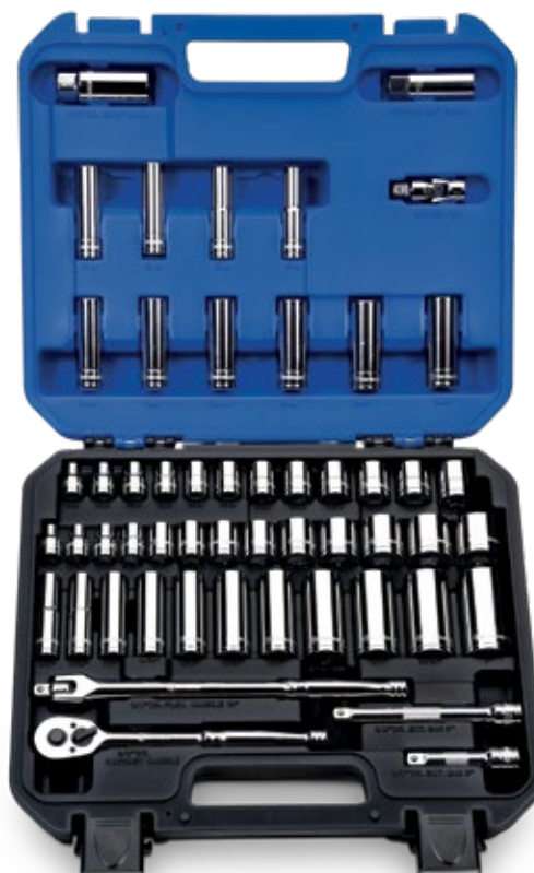
Part No. SN20002A