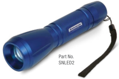
Part No. SNLED2