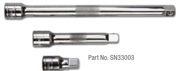
Part No. SN33003