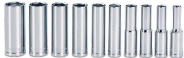
Part No. SN14001