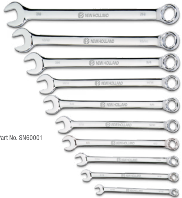
Part No. SN60001