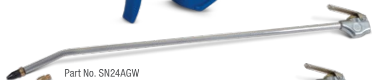
Part No. SN24AGW