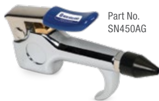
Part No. SN450AG