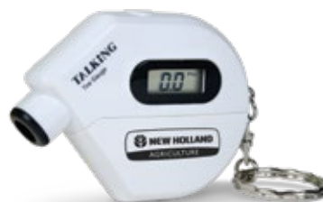
Part No. SN50080