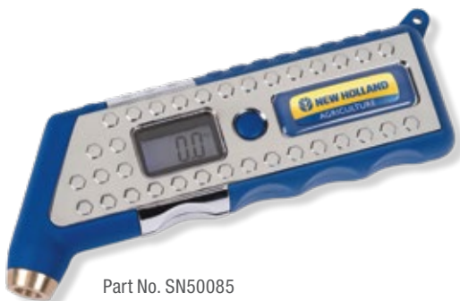
Part No. SN50085