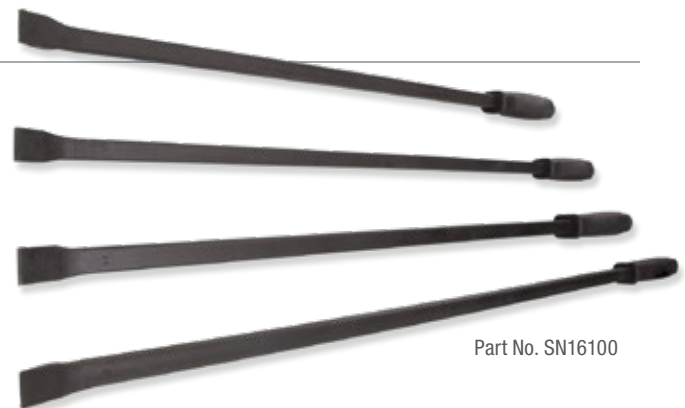
Part No. SN16100