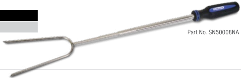
Part No. SN50008NA