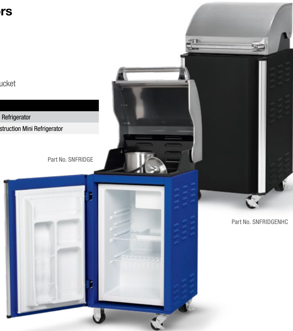
Part No. SNFRIDGE