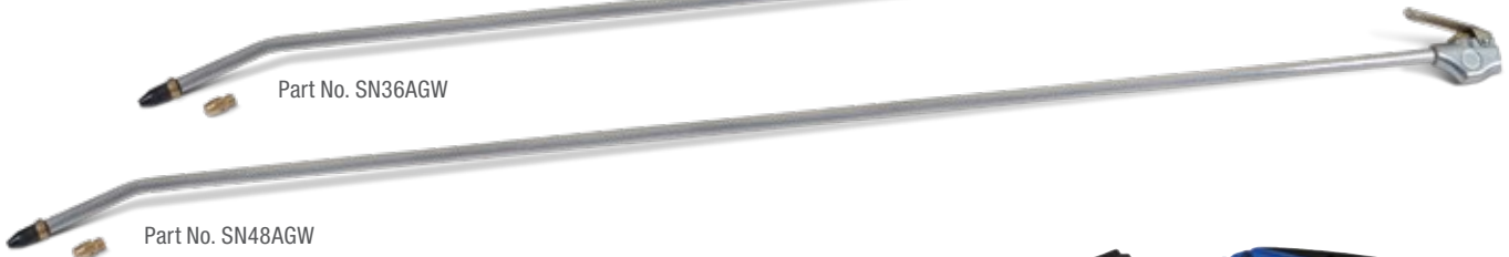
Part No. SN48AGW