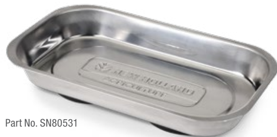
Part No. SN80531