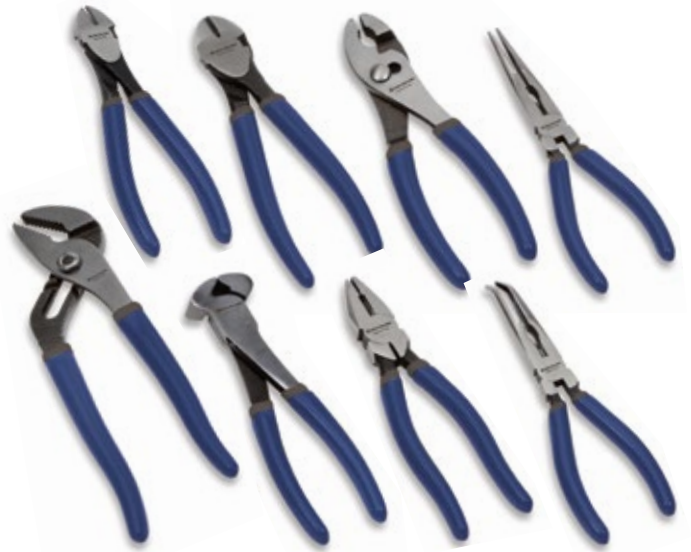
Part No. SN90408A