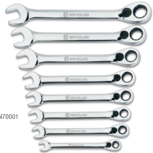
Part No. SN70001