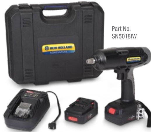
Part No. SN5018IW