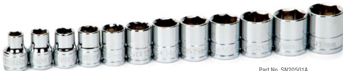
Part No. SN20501A