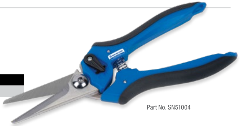
Part No. SN51004