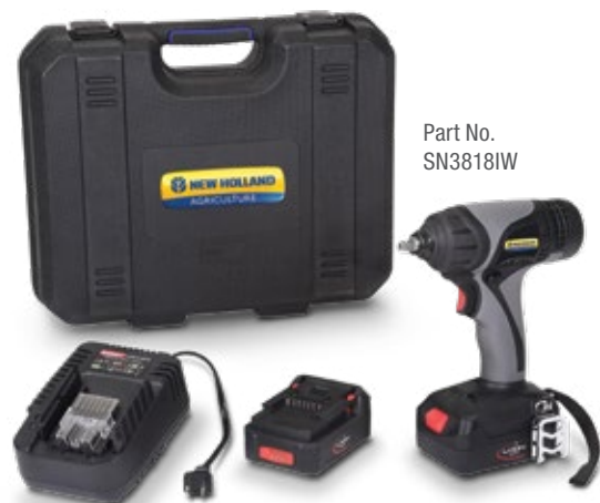
Part No. SN3818IW