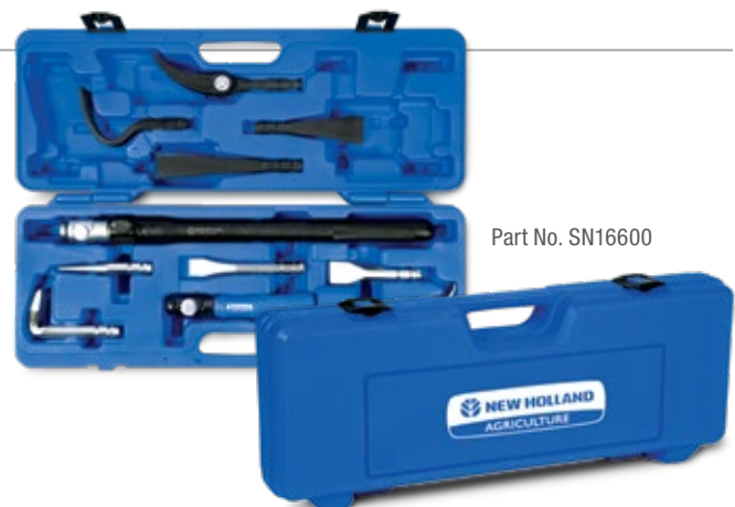
Part No. SN16600