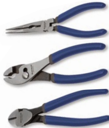
Part No. SN90001A