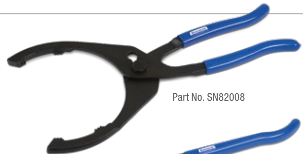
Part No. SN82008