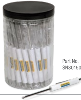
Part No. SN80150