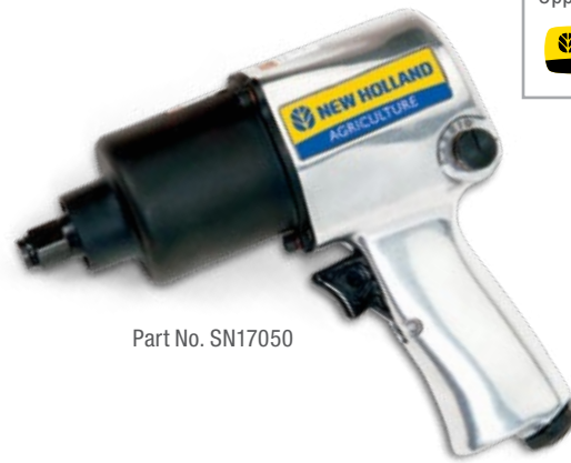
Part No. SN17050