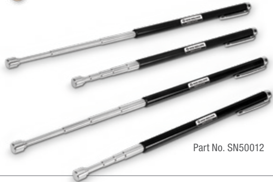
Part No. SN50012