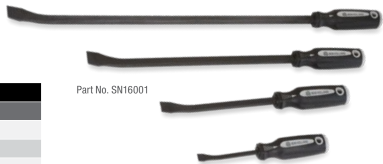
Part No. SN16001