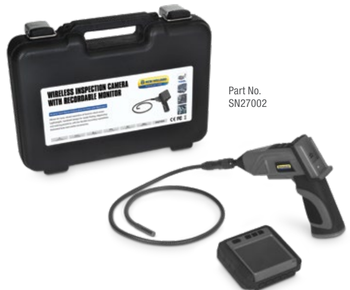
Part No. SN27002