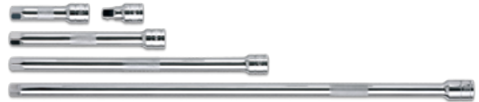
Part No. SN23005