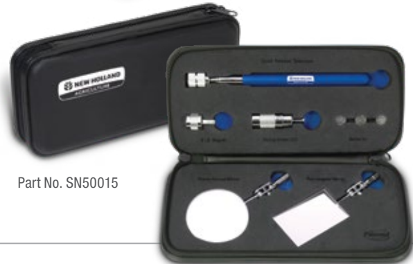
Part No. SN50015