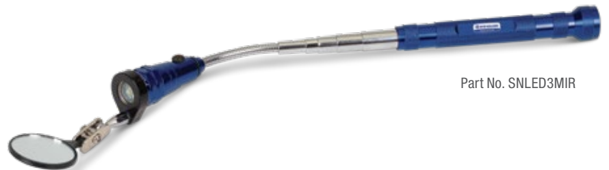
Part No. SNLED3MIR