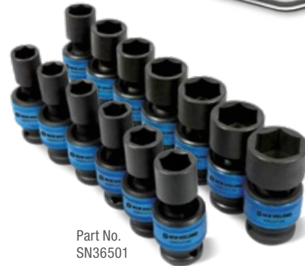
Part No. SN36501