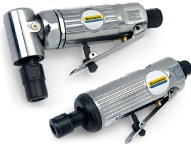
Part No. SN17400