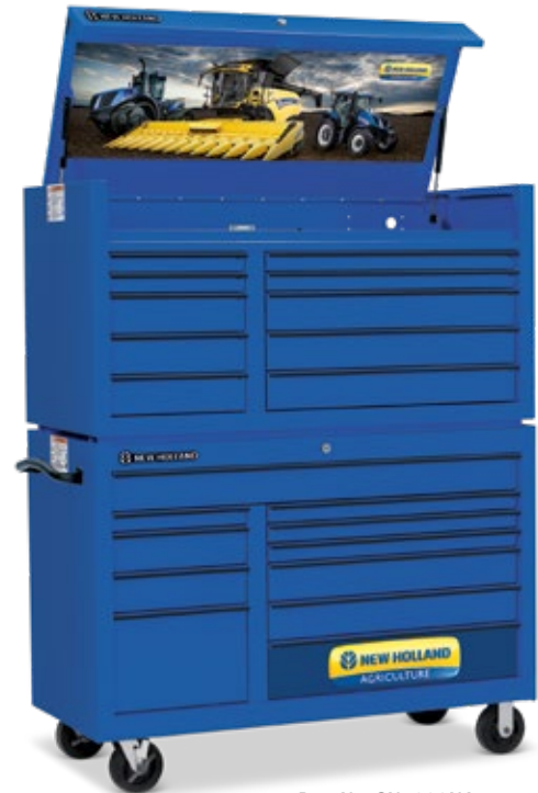
Part No. SN5000NA