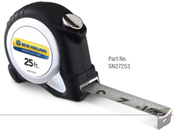
Part No. SN27253