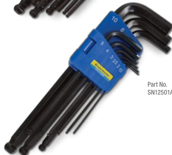
Part No. SN12501AA