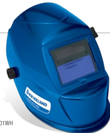
Part No. SN001WH