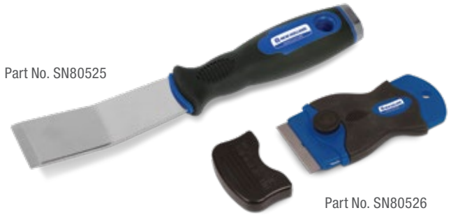
Part No. SN80526