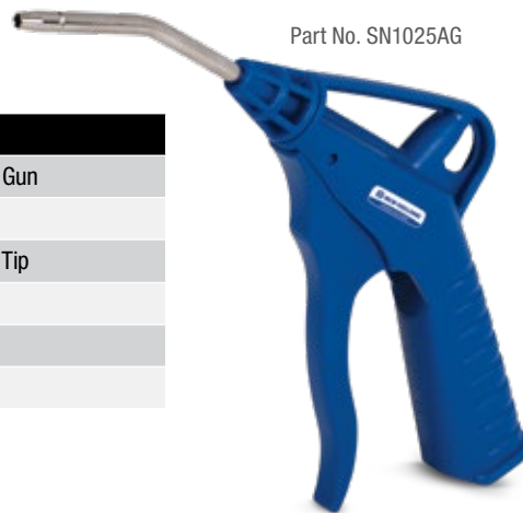
Part No. SN1025AG