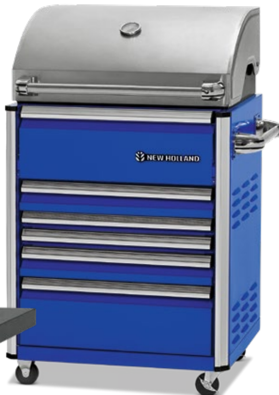
Part No. SNGRILL1NA