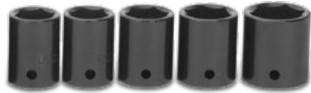
Part No. SN31001