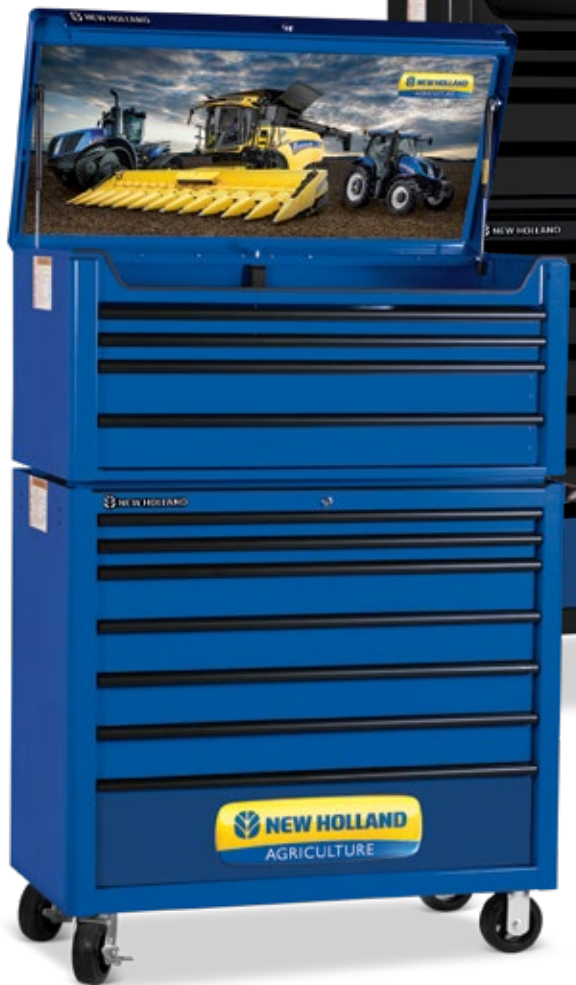
Part No. SN4000NA